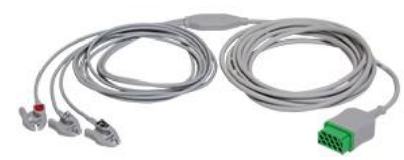
ECG TRUNK CABLE 3-lead leadwires, AHA