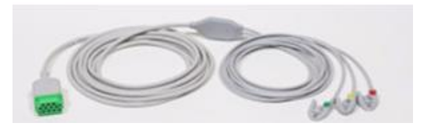
ECG TRUNK CABLE 3-lead leadwires, IEC