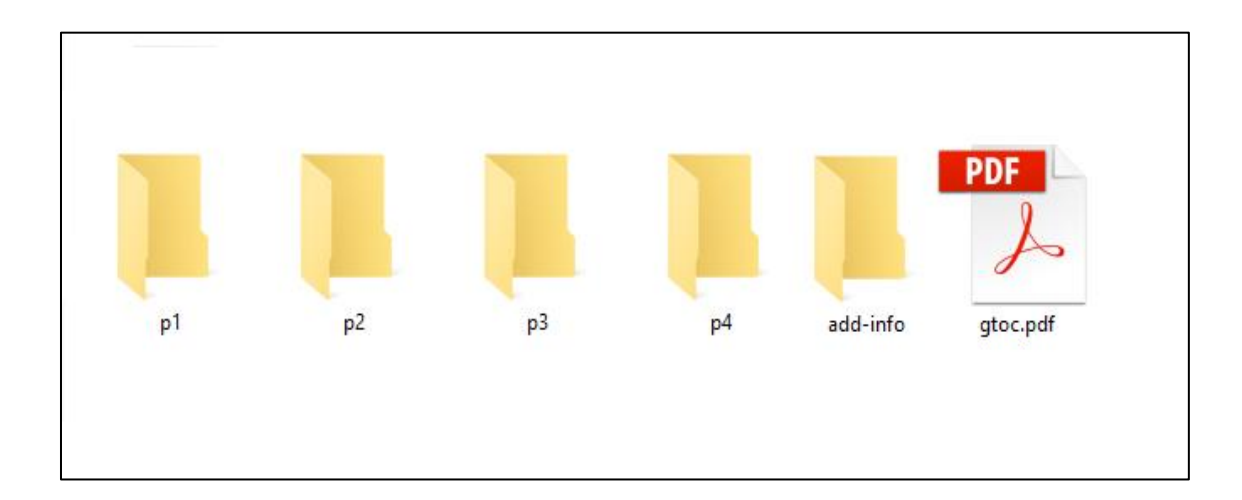
Figure 3: Structure of Veterinary Non-eCTD electronic Submissions (VNeeS).